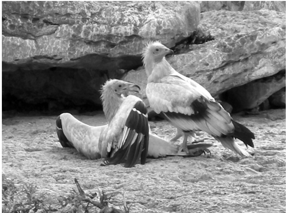
Egyptian vulture

He valued exercise, went on long walks and led a simple, austere life, sometimes turning down invitations to dinner and eating salad and seasonal fruits. He suffered a massive brain hemorrhage at his home after returning from a trip to Italy, and was buried in the Yemeni cemetery in South Shields.