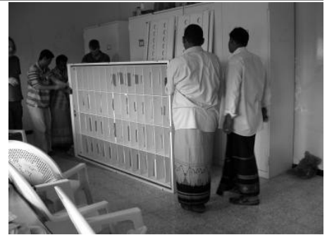
Moving the herbarium specimen cabinets to the new room.

It is hoped that this training will allow for the continued growth and usefulness of two very important educational and conservational resources in Soqatra. The Royal Botanic Garden Edinburgh hopes to further assist the development of these resources in the future.