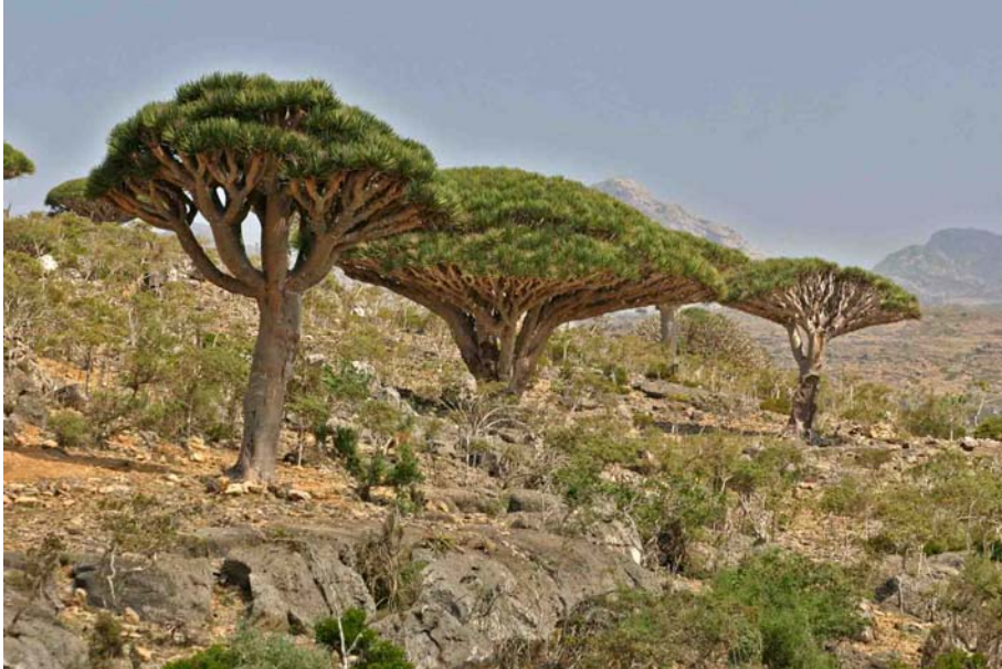
Dragon's Blood Trees, one of the species which has earned the island its World Heritage Site status.

Issued By FRIENDS OF SOQOTRA and SOCOTRA CONSERVATION FUND