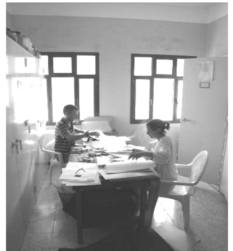
Working through the plant specimens to give names to unidentified specimens, and correct and update names where necessary.