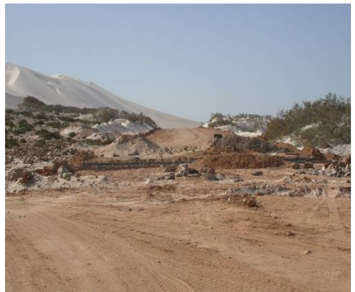
The Hallah to Irriseyl Road: November 2007, before road construction, and February 2008, the same areas after clearance along the road route.