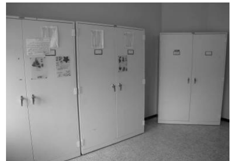
The new herbarium with cabinets in place.