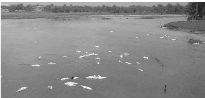
The Hadiboh Road. dead fish in Sirihin Lagoon (above), caused by the road blocking the natural flow of water between the lagoon and the sea, (right) build-up of algae.

During November 2008, a team of IUCN specialists, organised by Paul Scholte, visited Soqatra to address the issue of Environmental Impact Assessments for future roads. Following the visit, a meeting was held in Sana'a, attended by Paul Scholte, SCDP staff, the deputy minister of the Ministry of Public Works, and the IUCN specialists to discuss the mitigation measures described above. We will give an update on the outcome of these meetings in the next issue of Tayf.