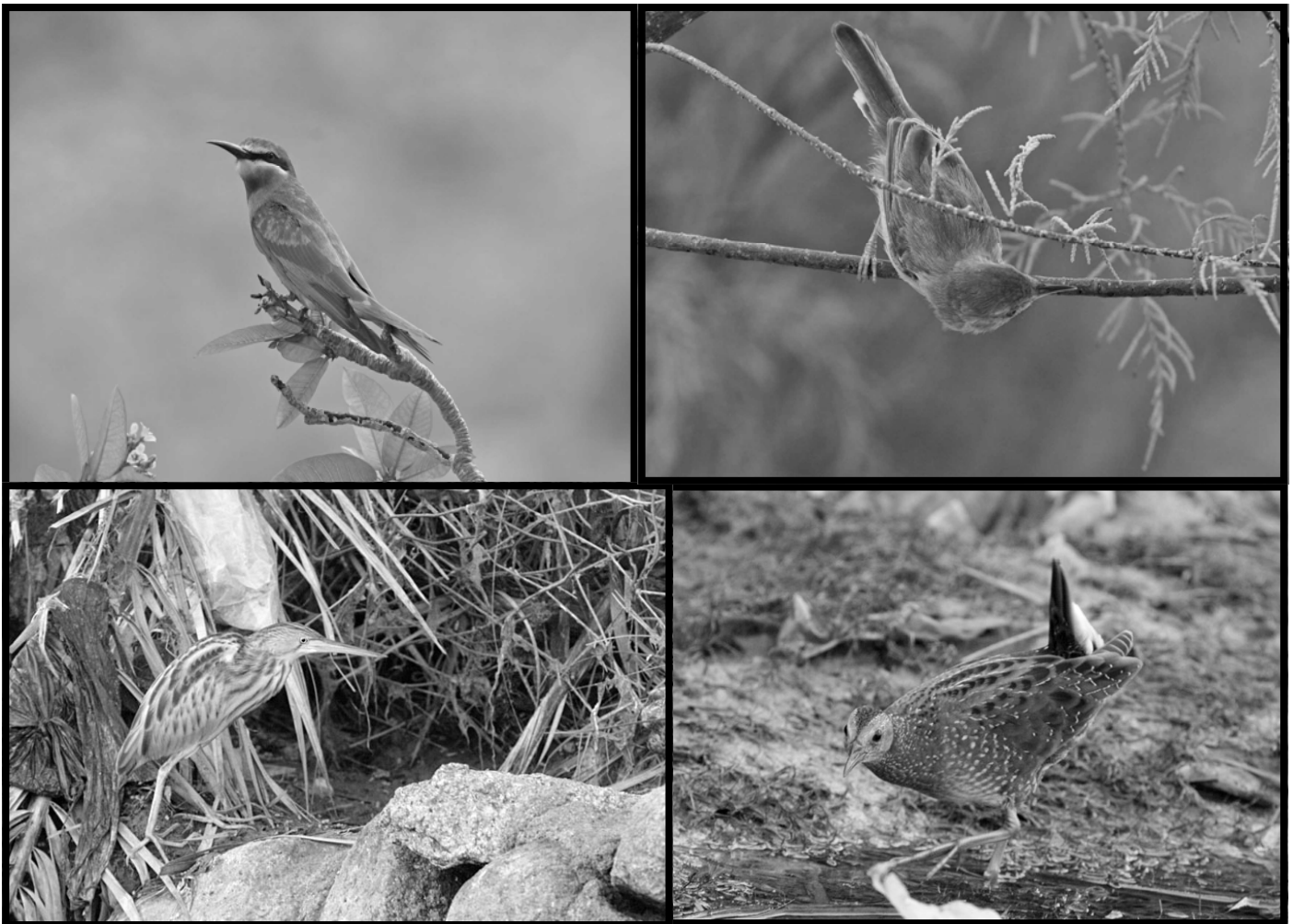
Recent photos by Richard Porter of birds on Soqatra, clockwise from upper left: Blue-cheeked bee-eater; Socotra warbler; Spotted crane; Yellow bittern

(*v) the references to 'security' and to camelmen being unarmed reflect the more bellicose situation to which the author was accustomed on the Yemeni mainland