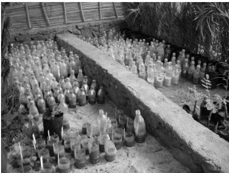
New cuttings and seedlings collected and grown in Adeeb's nursery, kept in plastic water bottles to keep the plants moist until they have rooted.