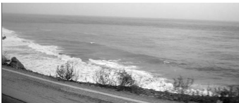
Sediment in the sea along the road to Irriseyl (h) and Mouri to Hadibo (j), where sediment is still being washed into sea along the road from Mouri to Hadibo long after construction.